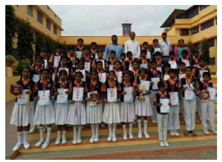
Pushpa students have once again brought laurels to the school.

Pushpa pupil have become district level karate winners with 7gold medals and 2silver and they are selected to state level.