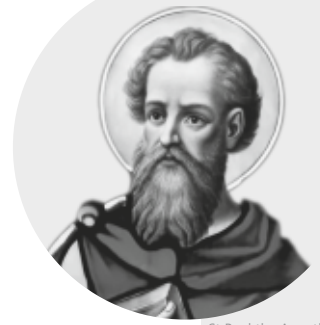
St Paul the Apostle