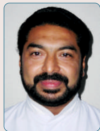
fr pittappilly tomy cmi 15 march 2010