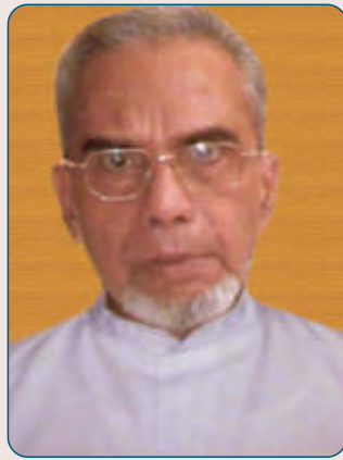
fr poondikulam lucas cmi 25 january 2005