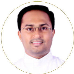
fr noble kumbiluvellil cmi anugrahalaya, hunsur