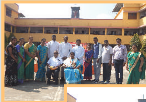
reception to award winners