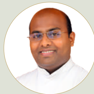
fr rejo kalathil cmi st mary's aspirant's house, koppa