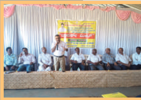
sslc taluk level toppers' meet